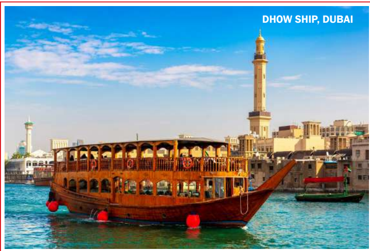
DHOW SHIP, DUBAI

After breakfast, we will proceed for a full day tour of Abu Dhabi. From the heart of Dubai we will travel past Jebel Ali, the largest man-made port in the world, to Abu Dhabi, the capital of the United Arab Emirates. An ultra-modern city, Abu Dhabi is situated on an island. Towering skyscrapers and glittering glass facades abound everywhere in the city, but a generous sprinkling of parks and gardens help maintain Abu Dhabi's reputation as being one of the greenest cities in the region. You will find it hard to believe that only 50 years ago, the city was no more than a fort surrounded by a modest village of date palm huts. After lunch in a local restaurant, we will see the age-old method of traditional dhow building at the dhow harbor, followed by a tour of the marvelous Al Husn Palace. We will complete the tour with a long, relaxing drive along the scenic Corniche and the Al Bateen palace area, before heading back to Dubai. Overnight in Dubai.